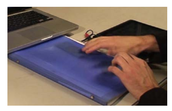
Figure 3: Piezo microphones under a corrugated plastic folder, allowing to hit, scratch, and strum a corpus.

The attack detection is not 100% accurate, but since the signal from the piezos is mixed to the audio played by CATART, the musical interaction still works.