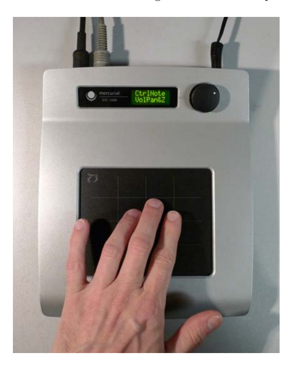
Figure 2: The Mercurial STC-1000 XY+pressure MIDI controller.

The Mercurial Innovations Group STC-1000 MIDI controller, now no longer produced, has a Tactex surface with a grid of 3x3 pressure sensors. Using SysEx, one can make it send the raw 1024 bit pressure data, and recalculate the position with higher precision as the standard output via the center of gravity of the pressure values. One can also determine the size of the touched area, given by the standard deviation. This allows to control one additional parameter by the distance between two fingers. See video example 4.1.