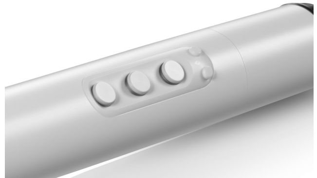
Figure 3: Buttons On Front Panel: Five buttons on the front panel substitute for buttons on a pedal. They offer on-off, toggle, or other instantaneous control over effects.

We placed five buttons on the front panel mic (see figure 3) in order to solve the eye contact problem. The buttons function just as buttons on a pedalboard would. Users can start, stop, and overdub their loops, toggle their reverb or distortion on and off, toggle through full effect presets and jump to the next section of a song. The buttons are particularly effective for live looping, as well as for controlling section-based software such as Ableton Live.