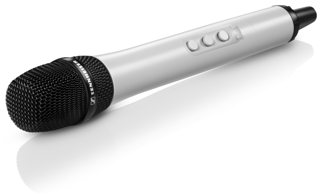
Figure 1: Concept Tahoe: A wireless microphone augmented with buttons, faders, and motion sensors.

In order to improve the interaction with loopers and other effects pedals, we have developed what we call the Concept Tahoe prototype microphone (figure 1). We have augmented a wireless microphone with buttons, faders, and motion/position sensors in order to give users obvious, intuitive and intimate control over their sound and looping effects.