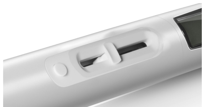
Figure 4: Continuous Control: Fader on back panel allows for continuous control over volume levels, wah-wah, etc.

The buttons were placed mid-way down the mic so that the vocalist can hold the mic in one hand and works the button controls with the other, maximizing agility. Three of the buttons are located lengthwise along the mic, with two smaller buttons that can be operated by the pinky finger. There are also LEDs beneath each button to provide visual feedback. These are controlled by MIDI in signals from the effects processor, and the mappings are entirely configurable.