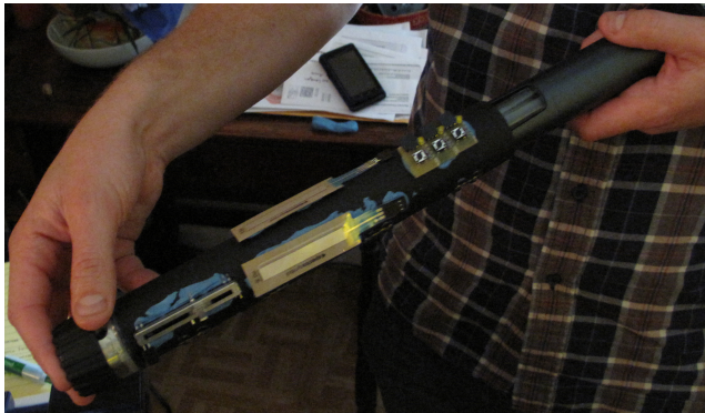
Figure 6: Early Tahoe Prototype: Early prototypes of the Tahoe mic were tested using sensors attached to the mic with blue putty, allowing for rapid prototype iterations and mutability, even during user testing.

Overall, response has been extremely positive, and most of our test users were eager to add the Tahoe mic to their arsenal of musical tools.